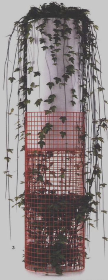
1 Orb suspension lamp, Modoluce 2 Knit lounge armchair, Ethimo 3 Net Light vase by F. Bortolani and E. Righi, Serralunga 4 Astolfo lamp by Amedeo G. Cavalchini, Lumen Center Italia Stockists on page 265