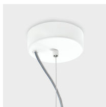
Ceiling rose detail