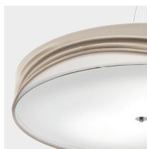
Removable and washable at 30° lycra, class M1