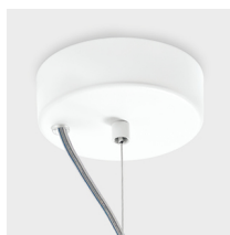
Ceiling rose detail