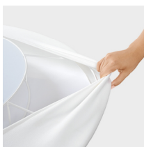
Removable and washable at 30° lycra, class M1