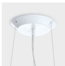
Ceiling rose detail