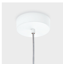
Dettaglio rosone Cilindro 150