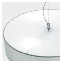
Particolare disco chiusura superiore in plexiglass versione E27