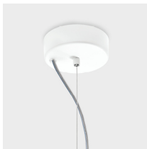
Ceiling rose detail