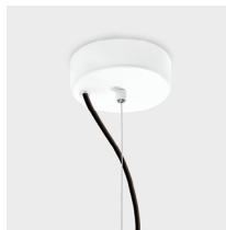
Ceiling rose suspension 1 steel cable Atollo 70 and Atollo 100