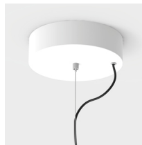
Ceiling rose suspension 1 steel cable Atollo 150