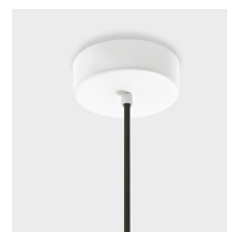
Ceiling rose suspension 3-4 steel cables