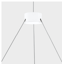
Connection for suspension 1 steel cable