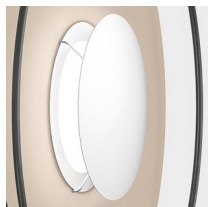
Dettaglio accessorio antiabbaglio