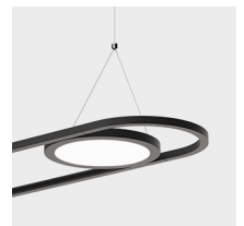
Connection for suspension 1 steel cable