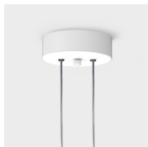
Ceiling rose detail L160 white or graphite