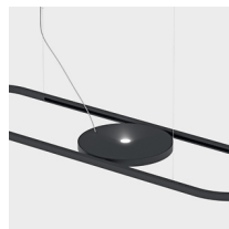
Uplight and downlight emission detail